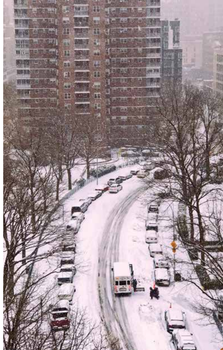
"Life Goes On."

We haven't yet seen the technologies nor the financial incentive packages to make investments in