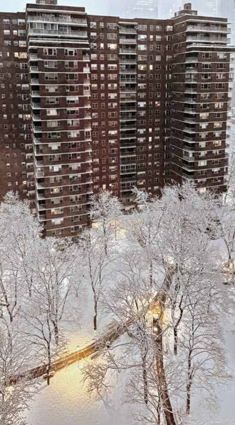
A dusting of snow covers campus trees.

issues in certain buildings with the quality of the hot water at the tap.