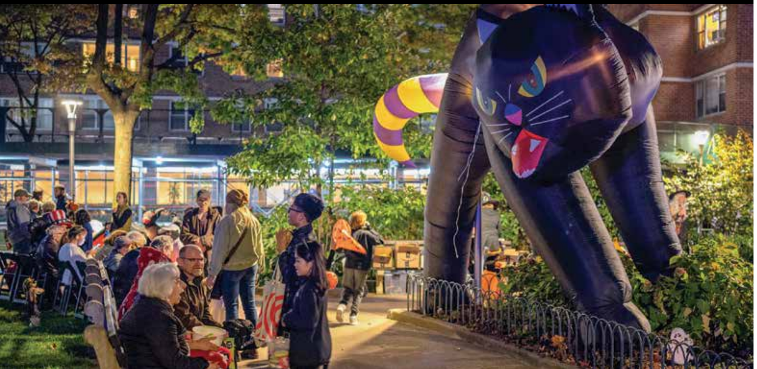
Costumed cooperators trick-or-treat at the Parents Committee's Halloween event.

The space is beginning to take shape. In the early part of 2023 we installed underground infrastructure for electricity and plumbing. The electricity will