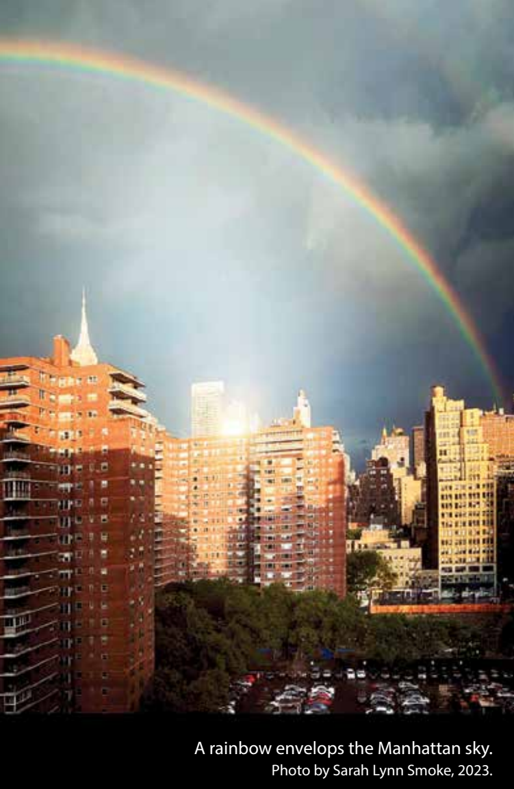
A rainbow envelops the Manhattan sky.

A positive aspect of our commercial portfolio is the ground lease for 335 Eighth Avenue at the corner of West 26th Street. The leaseholder, MAG Partners, is constructing a new building on this site at their expense. In calendar year 2024, MAG Partners will pay $2.1 million in annual rent to Penn South, more than we collected from the old structure, and these payments will increase according to a schedule.