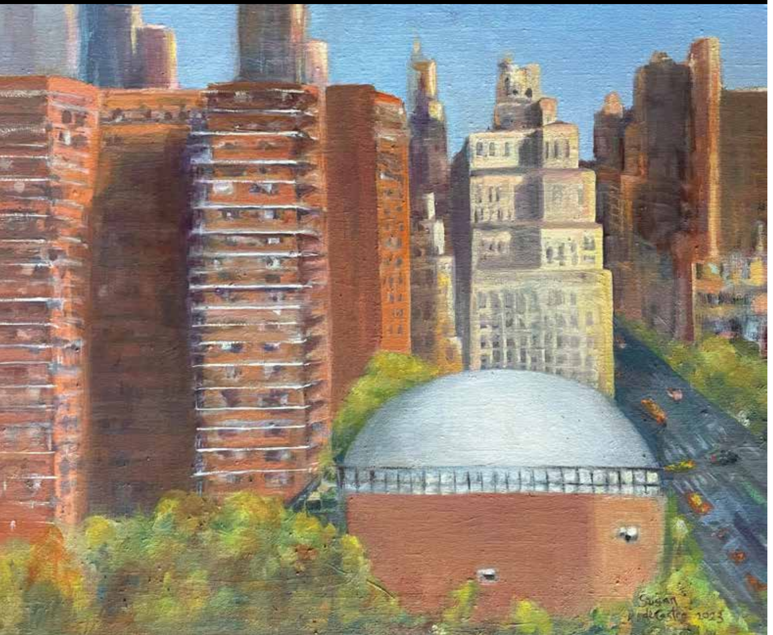
"How It Was: The View From My Balcony In Building 6B" by Susan de Castro, oil on canvas, 2023.

Our most recent purchasing contract for diesel fuel, which began in 2019, kept our costs between $1.85 and $2.38 per gallon. That contract expired