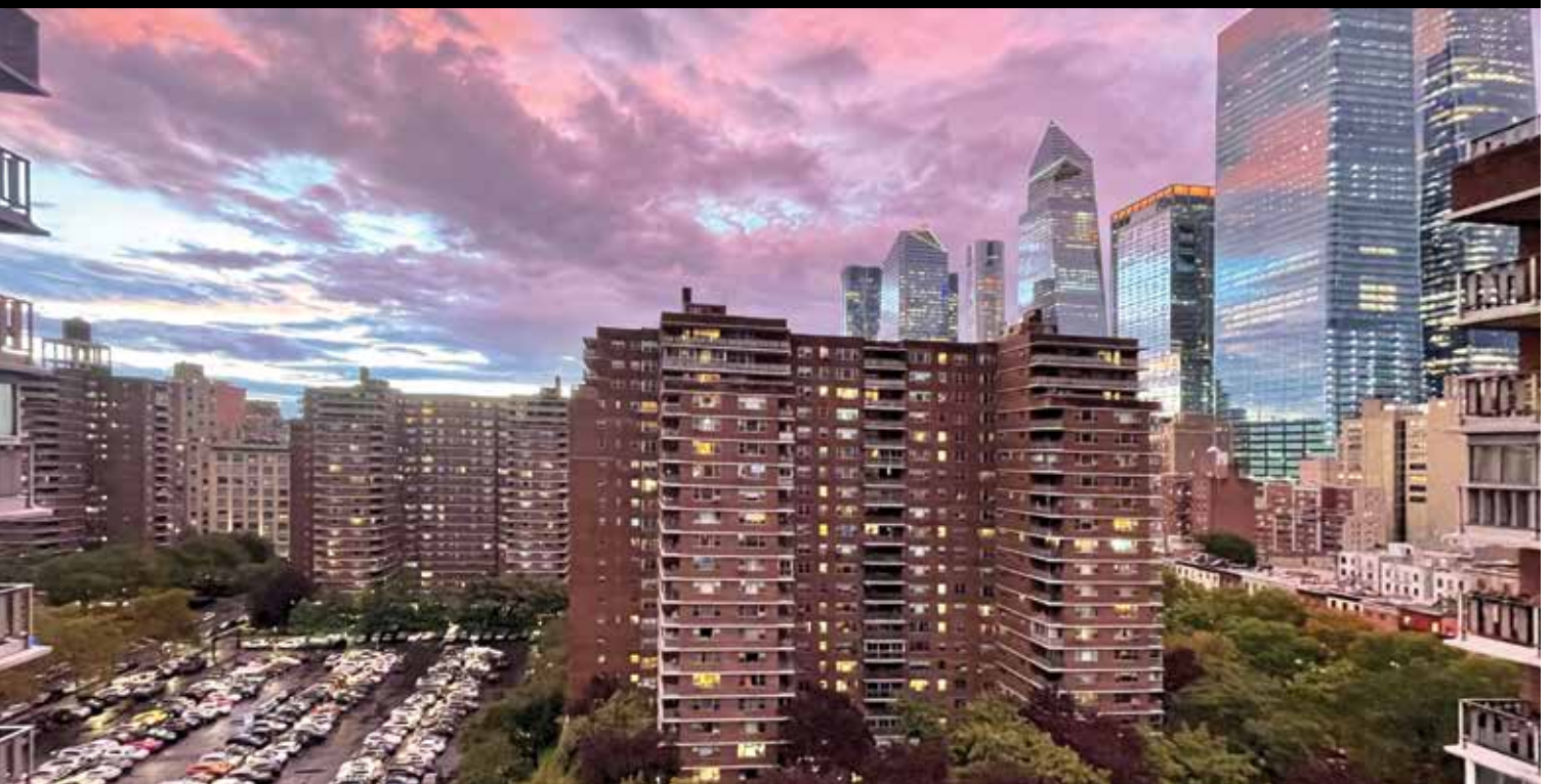
Glass towers and a shimmering sky behind Building 7.

Working closely with the team at our powerhouse, our engineering consultants determined the specifications necessary for a fifth gas engine, which will replace one of our six remaining diesel engines. In this new configuration, the powerhouse will exclusively run on gas for the majority of the time. The remaining diesel engines will primarily be for standby capacity. During periods when our region