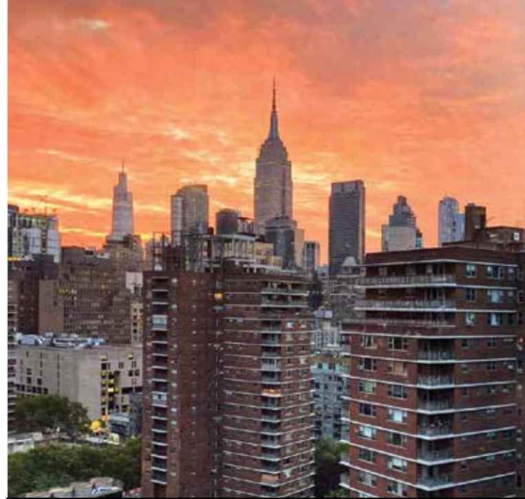
Morning skies ablaze.

PSSS hosts an array of classes, activities, and events throughout the year. This includes efforts from its largest and longest-running operation, the Penn South Program for Seniors, as well as offerings for cooperators of all-ages. I’m impressed at how PSSS continues to branch out and find new ways to serve our community. One of its newest initiatives is a collaboration with a Community Supported Agriculture (CSA) network, which operates from a co-op community room on a weekly basis. Farmers from upstate New York offer fresh produce at an affordable price to cooperators, and our reliable business helps keep small local farms sustainable.