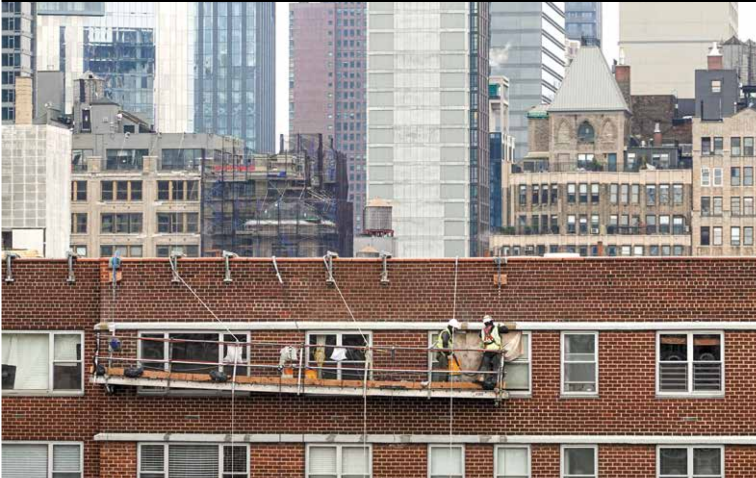
Facade repairs twenty-one stories in the sky. Photo by Barbara Minsky, 2022.

As we approach phases of the construction project that involve noisier activity, we remind cooperators who live close to the construction that we have opened two comfort rooms. One operates in the Building 5 Community Room every weekday and includes couches and a TV; the other is available in the Building 2B Community Room on Tuesdays and Thursdays.