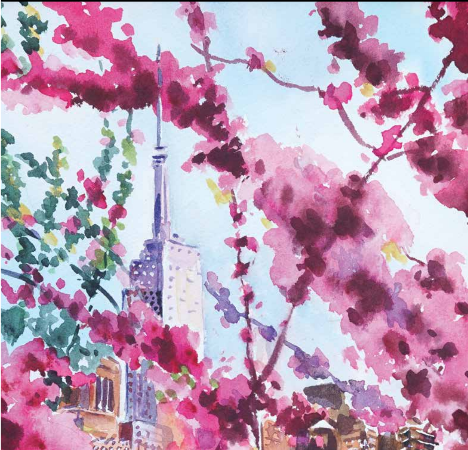
Watercolor on paper by Cyd Rosen, 2023.

From FY2021 to FY2022, when inflation was spiking, our expenses for repairs and maintenance rose by $1.77 million, a 32 percent increase. We also had an unusually high volume of apartments to restore that year since vacancies accumulated during the first year of the Covid-19 pandemic. Price growth has slowed, but repair and maintenance expenses still rose by $411,000 between FY2022 and FY2023, an increase of six percent.